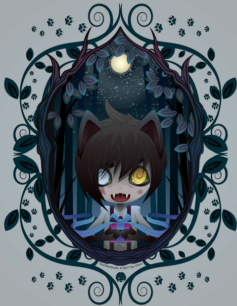
“Vicious Wolf Under The Moonlight”