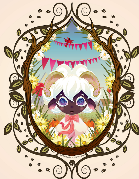
“Fluffy Sheep Among The Prairie”